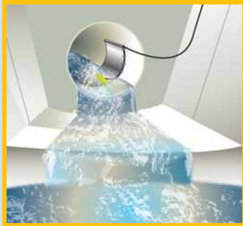
Culverts and Odd Shaped Channels