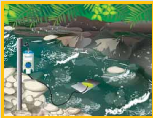
Creeks, Rivers and Streams